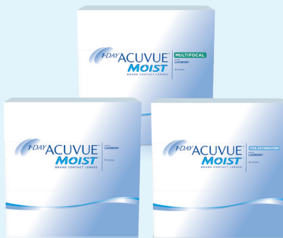
1-DAY ACUVUE® MOIST 1-DAY ACUVUE® MOIST for ASTIGMATISM 1-DAY ACUVUE® MOIST MULTIFOCAL