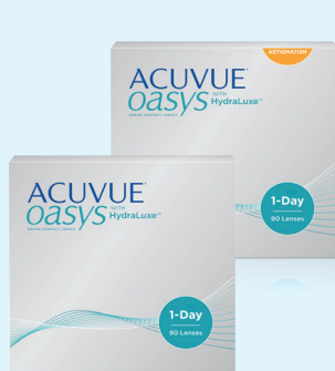
ACUVUE® OASYS 1-Day ACUVUE® OASYS 1-Day for ASTIGMATISM