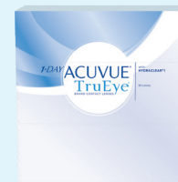
1-DAY ACUVUE® TruEye®